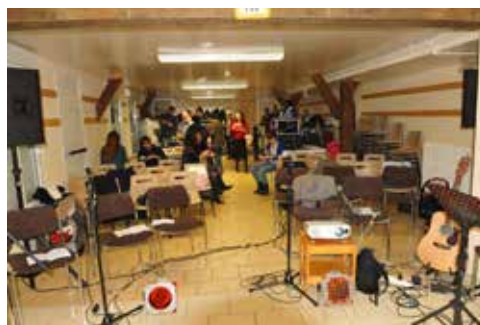
2013 : preparations for the Christmas celebration in Aubevoye