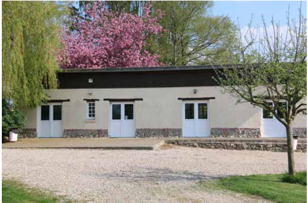
2019 : our church in Corny

After the official creation of the EPEPE in 2012, we felt the need to meet in a more accessible environment. We found a place also linked to the Catholic Parish, in Aubevoye this time. We decided to