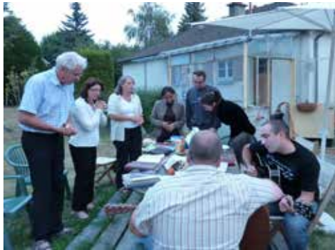
2009 : a moment of outdoor worship in Houlbec Cocherel

We have switched locations quite a lot in our existence – as a group and as a Church. We started gathering with a family, first near Vernon, then in Houlbec Cocherel when the host family moved in a new house.