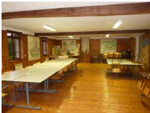
2011 : presbytery of Houlbec Cocherel

Later on we decided to rent a larger room in the Catholic presbytery in Houlbec-Cocherel, which we used until 2012.