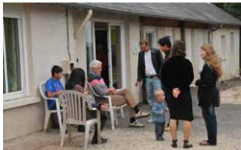
2011 : presbytery of Aubevoye

The first milestone of this new project was to find a more permanent place to stay, a home base to foster enduring relationships in the region. We decided to rent a building in Corny, a small village near Les Andelys. The building, in which the main room allows us to welcome up to 100 people, is surrounded by large gardens so that the location is ideal for children. We have already organized various meetings there: not only worship services, but also gatherings dedicated to children or festive meals such as “Le Noël du Coeur”.